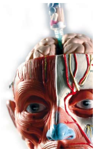
Cosmetic surgeries might affect your brain.

wrinkles, and for enlarging and re-shaping some body parts (e.g. breasts). For instance, breast enlargement is designed to increase the size or re-shape of a woman's breasts through the use of silicone injection. Possible side effects of these injections may include the following: discomfort caused by needle, swelling, redness, and also it can cause serious health problems if it migrates to the lungs or other organs. In view of the above, I would like to advise you as follows: -Stay away from bad advertisements about any