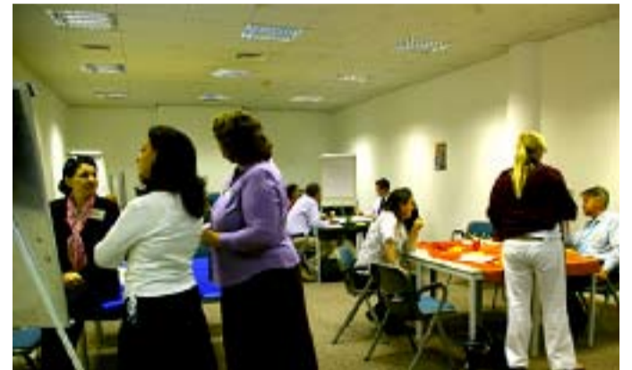
DWC teachers during the workshop.