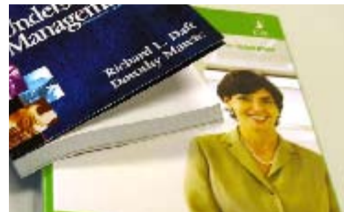
Management is one of the courses taught in the program.