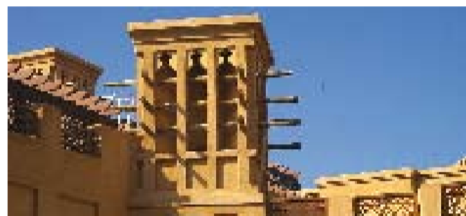
The Emirati architecture.