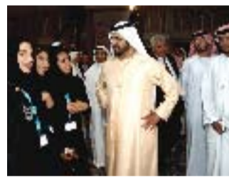
Students meet H.H. at Media Forum.