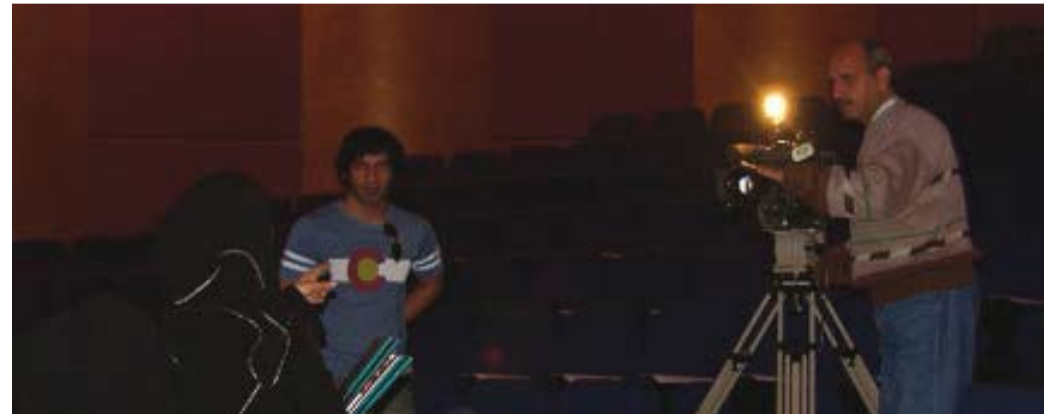
SFF 2007 receives media coverage.