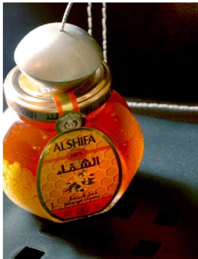
Honey can be added in cooking and desserts.