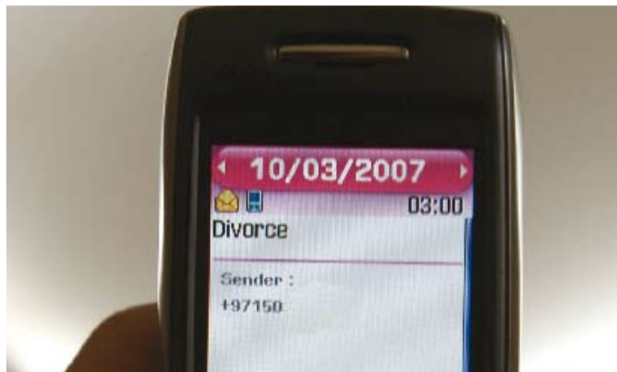
Divorced by SMS.