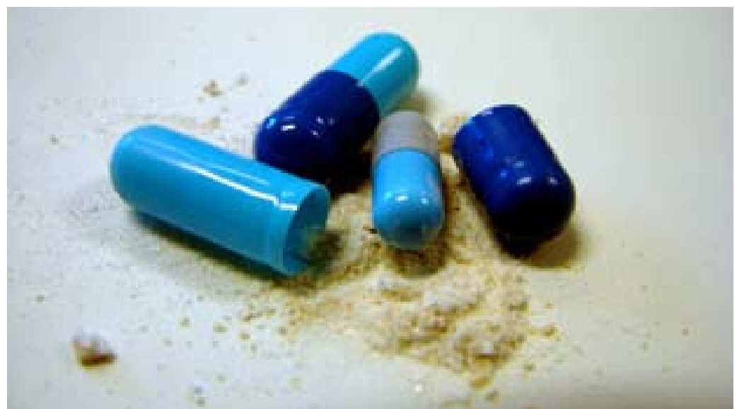
Resorting to weight loss drugs is not the best solution.

had taken the diet pills for a year, says that she initially lost 27 kgs, but later she started to face the pills side effects such as increasing heart rate, anxiety and chronic diarrhea. She stated that her health is not yet back to normal. Most diet pills work on the brain to suppress the appetite, and hence control weight. Buyers must use it very carefully under medical supervision; in fact overdose is a very common problem, which causes racing heartbeats, elevated blood pressure, and tremors.