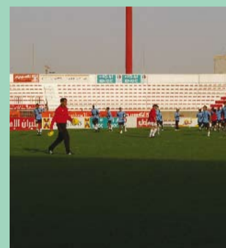
A tough coach is needed.