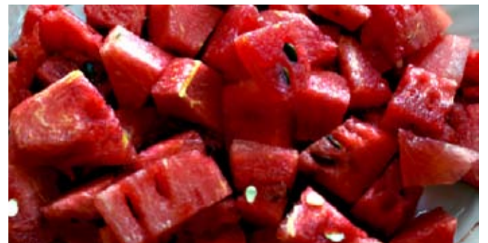
Watermelon is recommended for summer days.

ize free radicals. Watermelon has many benefits and it is a source of vitamin A, B6 and C. Each type of these vitamins is very important for the body health. In addition, watermelon is also a source of potassium, a mineral necessary for water balance.