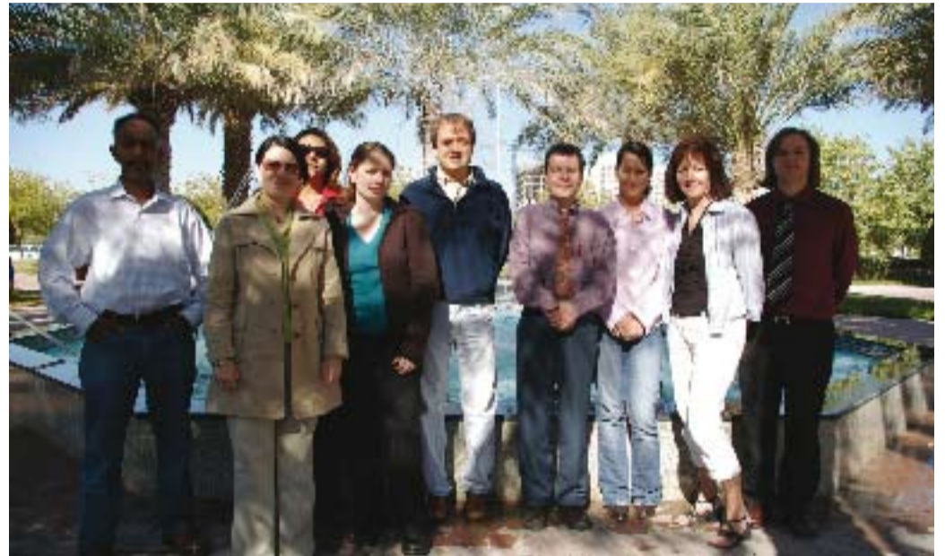
HCT faculty attend Final Cut Pro course.