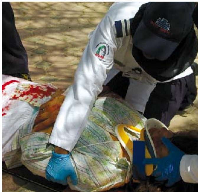
Paramedics students practise Mass Casualty Incident.

helped Health Sciences students practice handling mass casualty incidents: organizing their patients, treating the victims, transporting them, prioritizing things and organizing themselves to make everything run smoothly.