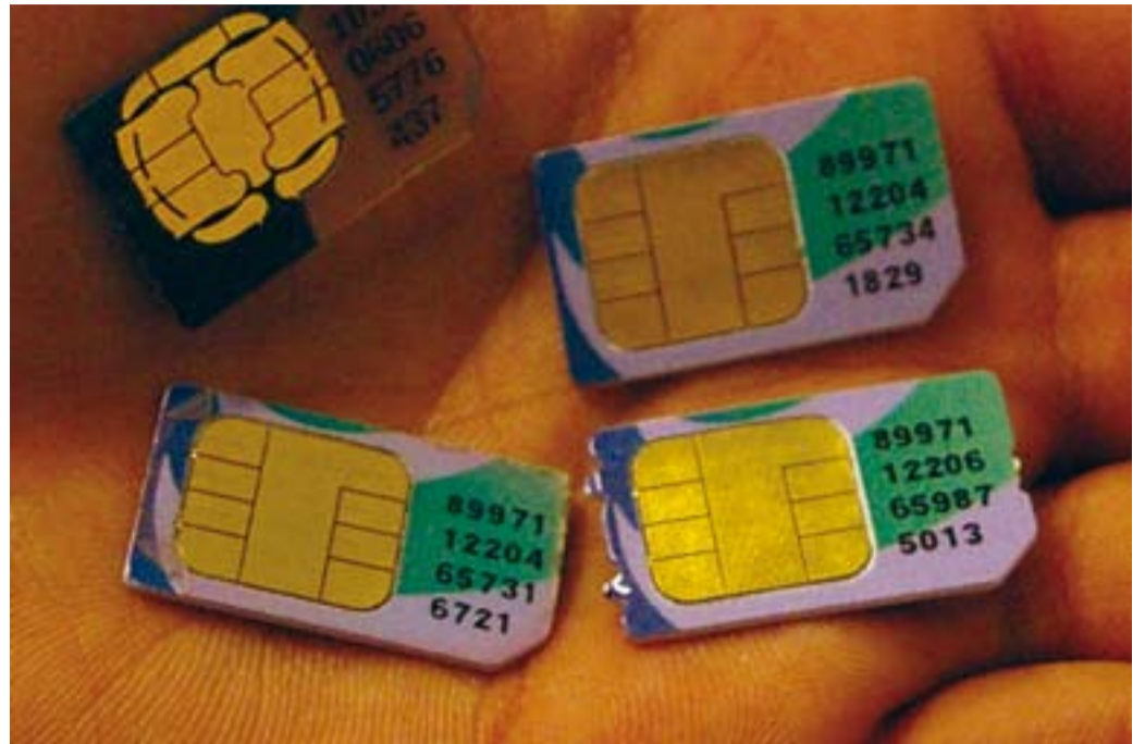
Collecting phone numbers is a new hobby.

Ahmed Al Marzouqi believes that collecting phone numbers is not just a hobby; it is a business. Ahmed says he might sell them at a point of time when the demand for numbers increases. "Those people who collect phone numbers as a hobby are people without a goal," says Ahmad. As UAE is developing in many ways, every day we see many new and unusual hobbies. Hobbies like phone number collecting are considered double-edge weapons; if we use it in a good way it will help us a lot, otherwise it might be a waste of money.