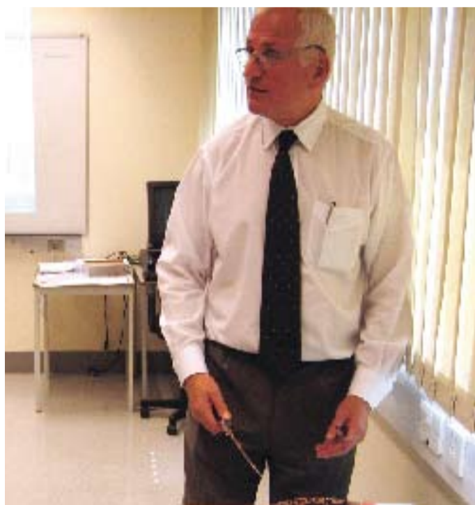
DWC Math Club celebrates 5th anniversary