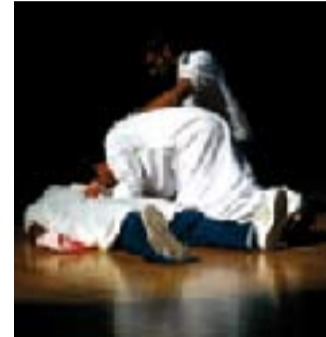
مشهد من مسرحية كفاية.