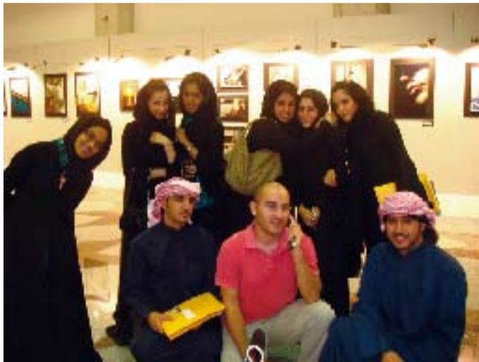
DWC students and young filmmakers participate in EFC.