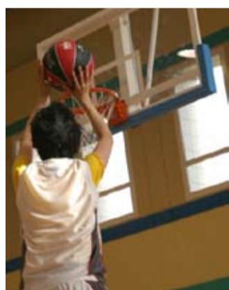
A DWC basketball team members are well trained.