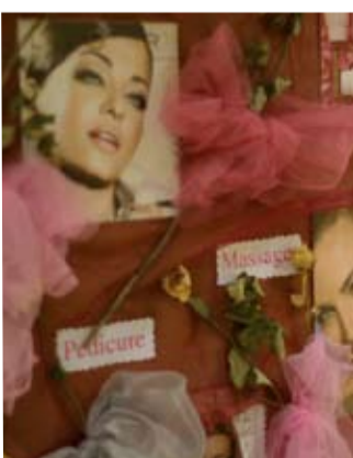
DWC beauty centre