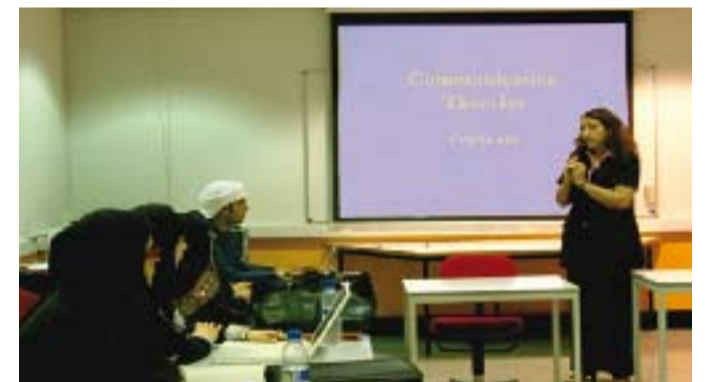
BAS students study Communication Theories in their first semester.