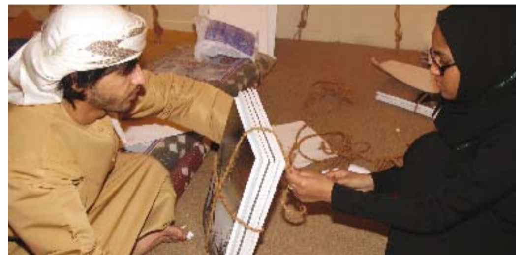
Students organize HCT Creation.