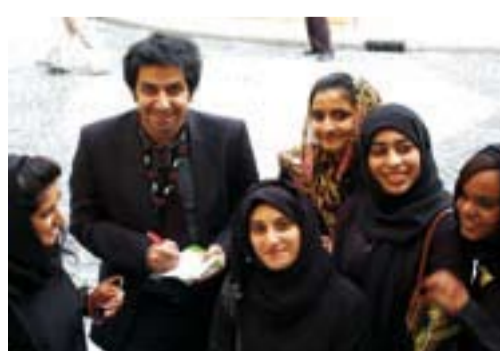
Mahmoud Bushihry, a Kuwaiti actor, with DWC students.