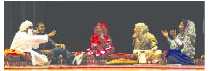
مشهد من مسرحية كفاية.