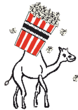
Dubai Womens Short Film Festival

very good experience because students did a lot of things like event management, graphics and filming. "I was in the management group and we worked on organising the festival and we were responsible for inviting guests," she added. Read more about SFF on www.dwshortfilmfestival.blogspot.com