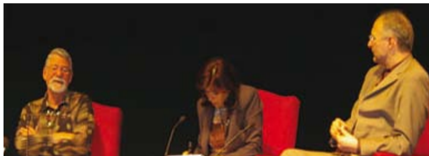
Barrie M. Osborne, the producer of Lord of The Rings in a discussion panel.