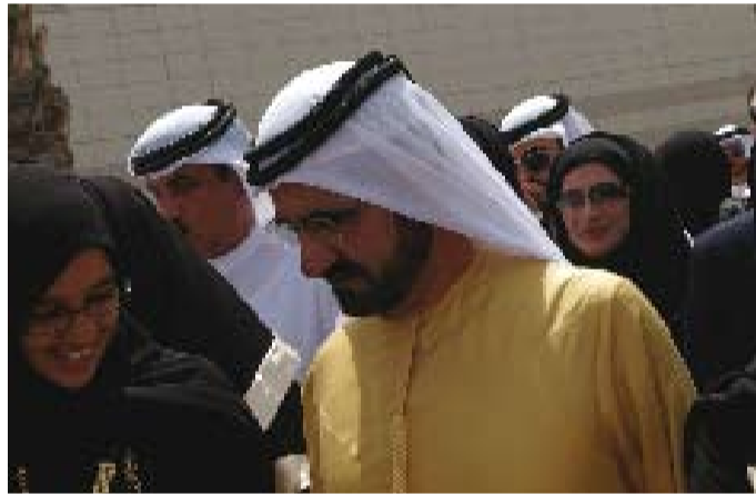
H.H. Sheikh Mohammed tours DWC campus.