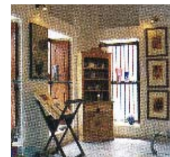
Old house of art

the future we have a very secure place to operate from," Alison says. Alison, who finds Dubai a city of architecture, opened this gallery when she decided to settle in one of the old wind towers Gulf Art Fair, first contemporary international art fair launched on March 8 th 2007 in the