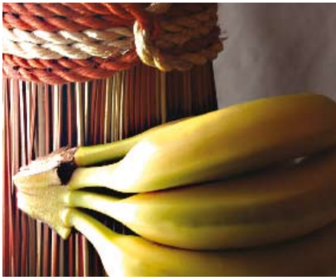
Banana is a natural remedy.

vitamin B6 and B12, potassium and magnesium are found in bananas. These vitamins and minerals can help the body fight the effects of nicotine. If a mosquito bites you, try rubbing the inside of a banana skin on the target area in the body, it will lessen any chance of swelling. Bananas are useful in anemia cases as high iron is found in them and this stimulates red blood cells to produce hemoglobin. According to the New Zealand Journal of Medicine Magazine surveys, having and eating banana in a regular diet can decrease the risk of strokes in average people by up to 40%. Besides that, they contain one of the most valuable elements which is potassium. If you compare between apples and bananas you will see bananas have twice the carbohydrates, three times the phosphorus, four times the protein and five times the vitamin A and iron and that is why it is considered a natural medication.