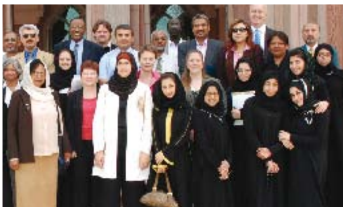
Students and media practitioners participate in the workshop