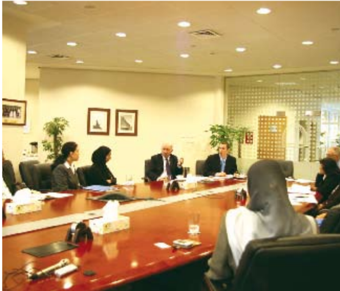
Both institutions discuss partnership plans.