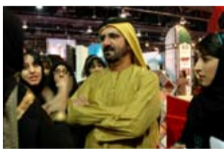
H.H. meets DWC students in Careers 2007.

Marking the UAE Career Fair 2007, His Highness Sheikh Mohammed Bin Rashed Al Maktoum, UAE Vice President, Prime Minister and Ruler of Dubai, said, "I am very proud of the Career Fair because it started as a small idea to support the