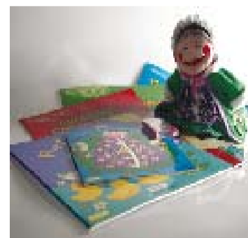
استخدام القصص المصورة في تعليم الأطفال.

يجب عليه أن يدعم العمليات التربوية ككل بتنمية القدرات الفكرية والخبرات العملية . فالأطفال في الثالثة وحتى الخامسة من العمر يتعلمون بالإكتشاف والأنشطة الحركية تساعدهم في تثبيت المعلومات لديهم . أما في الخامسة وحتى الثامنة يكونون أكثر قدرة على الإستقلالية في البحث والتصميم وحتى يتحقق التوازن بين المعرفة والتكنولوجيا والتطبيق فيجب أن يتضمن منهج التربية التكنولوجية ثلاث محاور أساسية وهي : 1-تنمية الثقافة التكنولوجية: عن طريق دراسة موضوعات تتعلق بالتكنولوجيا وتطوراتها وإنجازاتها وأثرها على المجتمع. 2-ممارسة التطبيق العملي وإحترام العمل: عن طريق تشجيع الطلبة وتدريبهم على أداء الأنشطة اليدوية. 3-الإبتكار والتفكير العلمي لحل