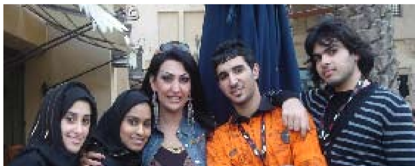
DWC and DMC volunteers with Huda Al Khatib, an Emirati actress.