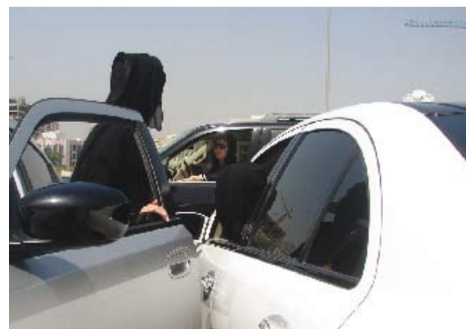
A sport car with a feminine touch.

look up for new rims, tiers and sports kits, while my brother doesn't." A luxurious car is a vehicle that emphasizes comfort appearance and amenities than anything else. Females are born elegant and stylish in fashion and lifestyle, so why not cars, she questions.