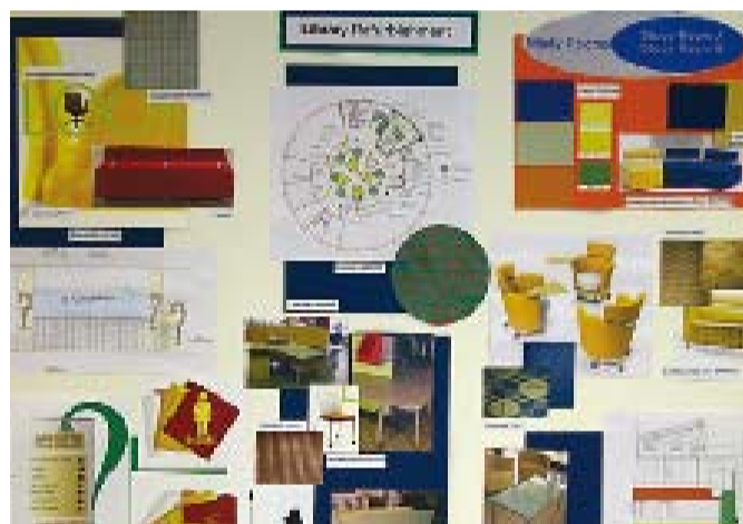
A display of the new furniture and decor at the LRC.