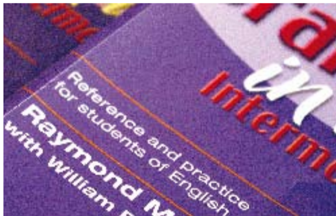
The language of Shakespeare.

The language of Shakespeare, Bush and Blair, of the Terminator, Matrix, and "Finding Nemo," is today spoken or understood to some degree by one in four of the planet's inhabitants. Demand for English is fast increasing from both non-native speakers, and from those three-quarters of humanity who have absolutely no English skills," says a report by the British Council. When you learn an international language, you gain knowledge and you become more humane and tolerant. Nowadays, English is a global language that is widely spoken by people of