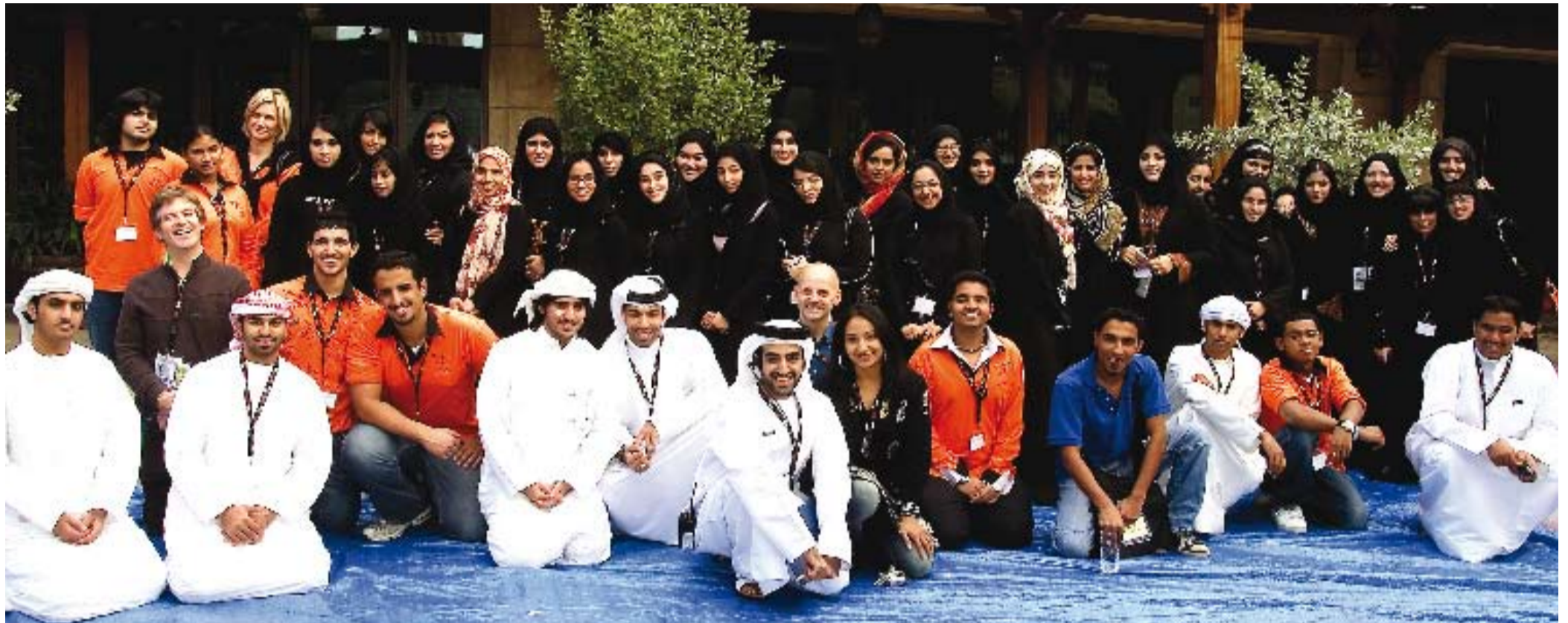
Volunteers from Dubai Women's College and other colleges and universities gather at Madinat Jumeirah, the main venue of DIFF 2006.

DWC students to volunteer at DIFF. Their participation and enthusiasm in DIFF 2004 and 2005 has been praised and appreciated by the festival organizers.