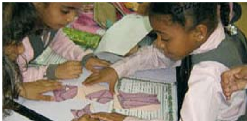
Pupils are engaged in creative activities.