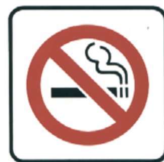
provided by: Moza Al Falasi