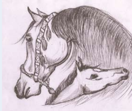
بريشة: زيد علي السنة الثانية، الإسعافات الأولية