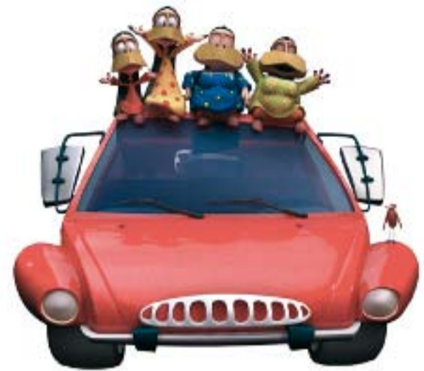
Freej characters.