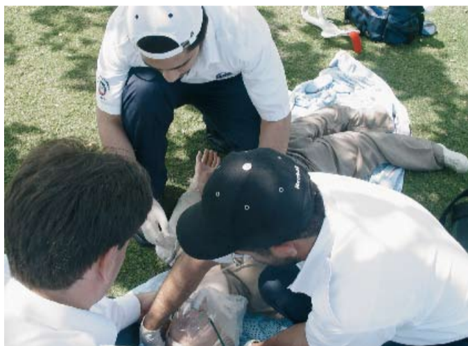
Paramedics in summer training.