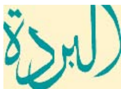
Illustrated by: Athijab Thani

The local category includes a poster design competition limited to HCT students and universities in the UAE.