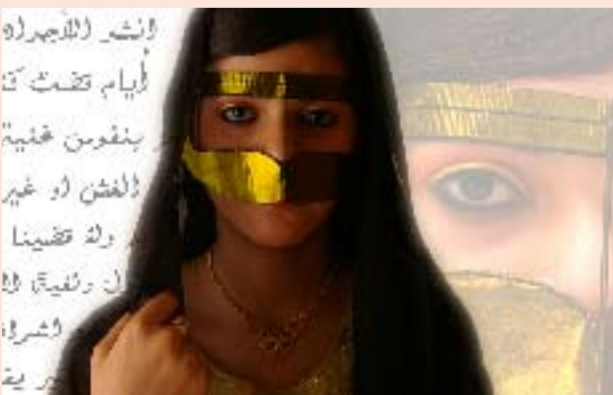
تصوير وتصميم : حفصة المطوع السنة الثانية، قسم الإعلام والاتصال الجماهيري

إنشد الأجداد وأيام قضت كنا فيها بعز بنفوس غنية ما عرفنا الغش أو غيرة وحسد ولا قضينا ليال باقوال ولغية الرجال أفعال واشراف ونسب والخوي بالخير يفزع له خويه كم غدا في الدين منا له عمد وكم حفظنا كتاب خلاق البرية النساء كالدركانن والذهب من ستر وإخلاق ووصوف ندية تحفظه هالزوج وبيتته والولد ولو تزول الأرض بتظل له وفيه زال ذاك العهد والدهر إخترب وباتت العادات من عقبه رديّة أبكي الشيمات وإخلاق العرب وغيره الرجال وفزعات وحمية لي غدن الحريم كاشفات الرقب تبعن الشيطان لي ساس الغوية خصرن العبي سمعن للطرب صبغن الوجيه نادن بالسوية طاحن الشيل من عقب الخجل ناظرن الرجال باعيان جريّة والعطر لي فاح من جنبهن وشب كأنه نار تضيع برياح الخطية والا من الرجال أخيرهم شرّب لا درى بالبيت وناس في حويه جاب من العيال وكثر بالنسب هل يظن بيومه كانوا له فدية يطلب الأموال ويكثر بالطلب هل يظن بيعيش لي يوم الجزية كم حكما الراس والحين الذنب هل نزلنا القاع من عقب العلية لا تلوم الغير إن كنت السبب في بلاء البلاد واعواق البرية إلتزم بالدين حارب من فسّد بلخ الخيرات لو كانت شوية إذكر الرحمن إن غيرك غفل واحده عالحال والعيشة الرضية أرتجي هالقول والمغزى وصل والسوحة القوم ما قصدي بسبي