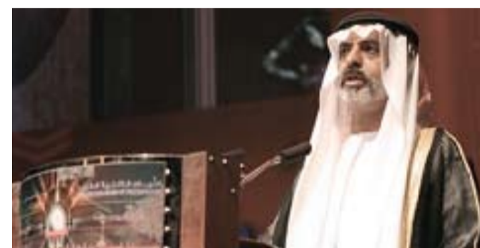
H.E. Sheikh Nahayan giving his speech.