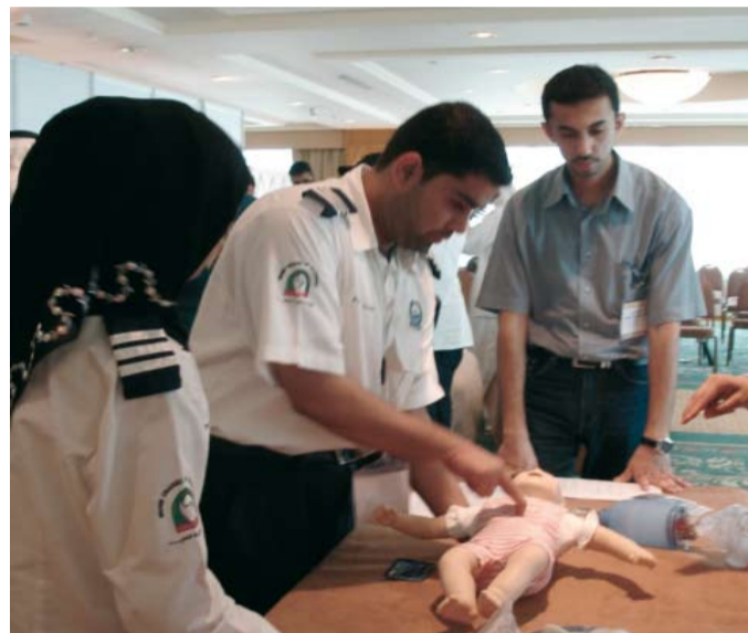
Paramedic students participating in workshop

programme has taught me that life is sacred and a single second can make a big difference in our life. Being a paramedic is a great thing and I'm glad that I entered this field, because I want to show people that locals are capable of excelling in any job he or she undertakes."