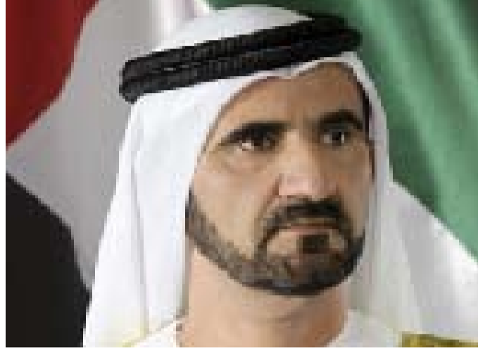
الصورة الرسمية للشيخ محمد بن راشد آل مكتوم

وقد حقق صاحب السمو حلم ١٥٥٠ طالباً وطالبة بعد أن سدت أبواب الكلية في وجوههم وفقدت الآمال باستكمال دراستهم لعجز الميزانية، وقام سموه بدفع جميع التكاليف لهؤلاء الطلبة لتشجيعهم على طلب العلم لبناء مستقبل واعد لجيل ملئ بالتفاؤل والحيوية والنشاط نحو مستقبل أفضل.. أضافت وندي فارل، رئيسة شؤون الطالبات، ” بأمر من سمو الشيخ محمد بن راشد تم قبول ٢٢٥ طالبة إضافية ستلتحق بالكلية بداية الفصل الدراسي الثاني لهذا العام“.