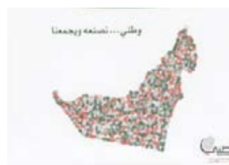
Emiritization at Watani.

programme, has been initiated to strengthen the sense of national solidarity in the country. "What makes a good citizen should be based on one's involvement in