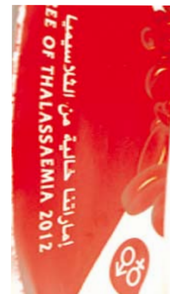
DWC Thalassemia campaign.