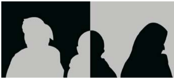
Children are the first victims of divorce.