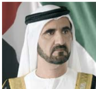
H.H. Sheikh Mohammed Bin Rashid Al Maktoum.