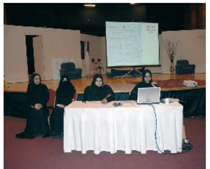
An orientation for high school students.

a student from Al Leseeli School said during students' question time at the end of the event that, "The event was beneficial and a lot of things that I was wondering about are now clear to me."