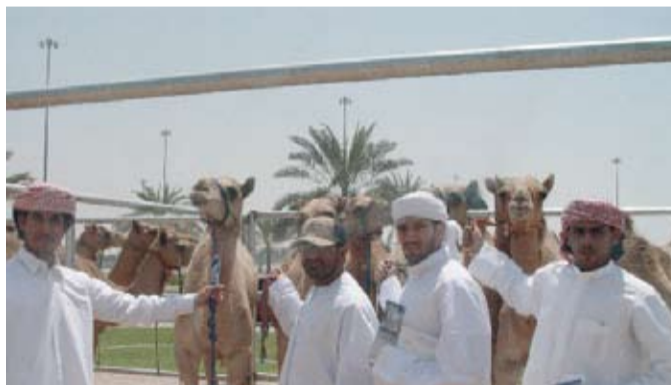
زوار المعرض يتفقدون الأسلحة والجمال.