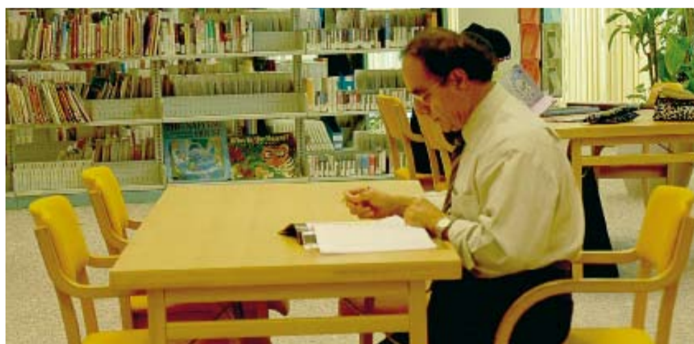
DWC Library offers new services.

study spaces were also added on the top floor. "We are making changes to the library to make the place more inviting for students to use. We are looking for any ideas or suggestions that students may have that would make the library a better resource for them," Stewart said.