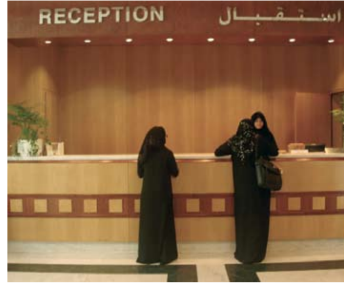
قسم الاستقبال في شكله الجديد.

حرصت كلية التقنية سنوياً على تجديد مبنى الكلية و تزويده بخدمات جديدة للظهور بحلة جديدة، ومن هذه التجديدات بناء مبنى يضم ٥٢ فصلاً دراسياً، وتم إضافة حوالي ١٠٠٠ موقف سيارات ليضم عدداً أكثر من السيارات أما النادي الرياضي الذي ضم حوض سباحة نصف أولمبي وقاعات