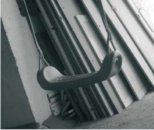
بعدسة: ليلي البلوشي السنة الثالثة، إدارة التسويق