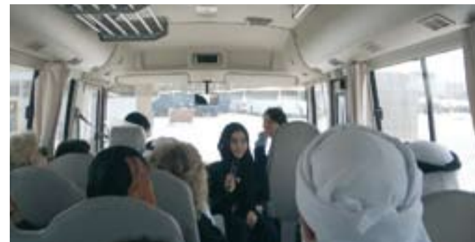
A DWC tour guide.

Nine students from the DWC Travel and Tourism section recently participated in a programme sponsored by the Department of Tourism and Commerce Marketing (DTCM) as part of their study course. The programme, which is organized annually to enable students to become certified tour guides for the city of Dubai, ran from September 10 to 21. "This programme enables students to learn about the fundamentals of tourism and how to market a destination. Students studying