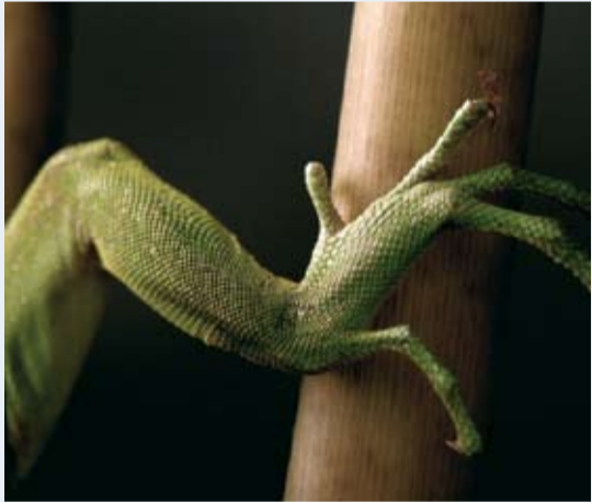
السنة الثانية، الإسعافات الأولية