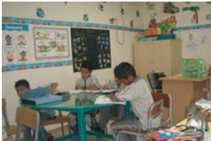
Children attend DWC summer school.