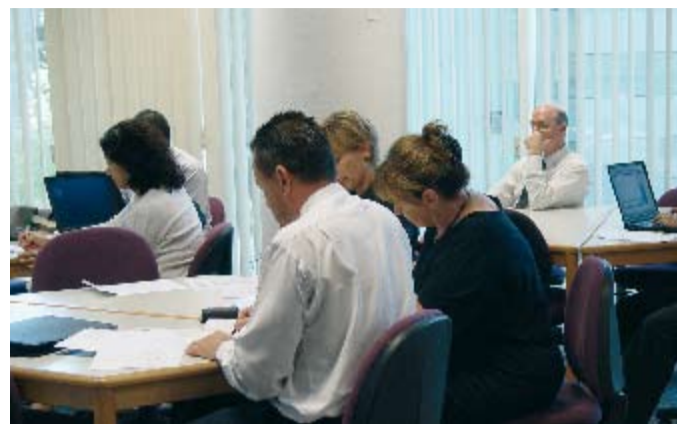
Faculty members attend CALM workshop.